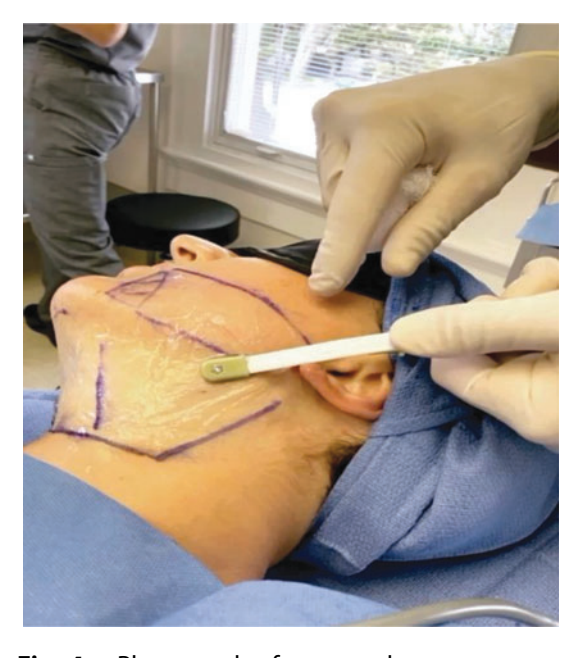
Fig. 4. Photograph of proposed treatment areas and "no fly" zone.

Unsuitable candidates include patients with a pacemaker or other implants, cochlear or neurostimulator implants; women during pregnancy; patients with collagen vascular diseases, autoimmune diseases, or acute infections; and patients with morbid conditions that could make them unsuitable for the procedure (Fig. 3). All implanted devices should be evaluated for contraindications from the manufacturer. Patients with abundant subplatysmal fat should be properly identified and counseled that percutaneous RFAL procedures do not address this layer and may be better managed surgically. Patients