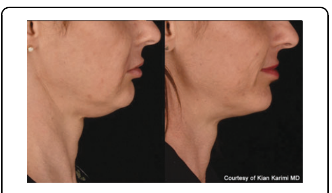
Fig. 10. Before treatment, 2 months after AccuTite/EmbraceRF treatment.

Fig. 9. Before treatment, 2 months after treatment. Treatment settings: FaceTite settings: internal: 40, external: 60, time: 120 s, Joules: 3.3 kJ to submentum Area 1: energy: 30, 24 pin, 4.0 mm, mode: fixed, No. of pulses: 66, repetition: 1.5 Area 2: energy: 30, 24 pin, 3.0 mm, mode: fixed, No. of pulses: 40, repetition: 1.5 Area 3: energy: 25, 24 pin, 2.0 mm, mode: fixed, No. of pulses: 50, repetition: 1.5