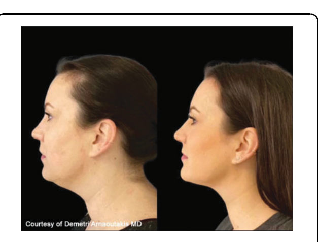
Fig. 6. Treatment settings. FaceTite: 38/68, 11 kJ (4 kJ delivered to R face/neck, 3 kJ to submentum, 4 kJ to left L face neck) Morpheus 8: 3 mm/30 energy, 200 pulses 4 mm/30 energy, 200 pulses 2 mm/20 energy, 100 pulses