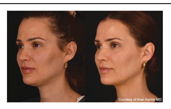
Fig. 9. Before treatment, 2 months after treatment. Treatment settings: FaceTite settings: internal: 40, external: 60, time: 120 s, Joules: 3.3 kJ to submentum Area 1: energy: 30, 24 pin, 4.0 mm, mode: fixed, No. of pulses: 66, repetition: 1.5 Area 2: energy: 30, 24 pin, 3.0 mm, mode: fixed, No. of pulses: 40, repetition: 1.5 Area 3: energy: 25, 24 pin, 2.0 mm, mode: fixed, No. of pulses: 50, repetition: 1.5

Treatment 4: Morpheus8 (24 pin) Submentum/jawline, tip: 4 mm, energy: 35 energy, pulse rate: single cycle, pulses: 44. Submentum/jawline—first pass: tip: 3 mm, energy: 30, pulse rate: single cycle, pulses: 47. Submentum/jawline—second pass: tip: 3 mm, energy: 30, pulse rate: single cycle, pulses (no.): 37